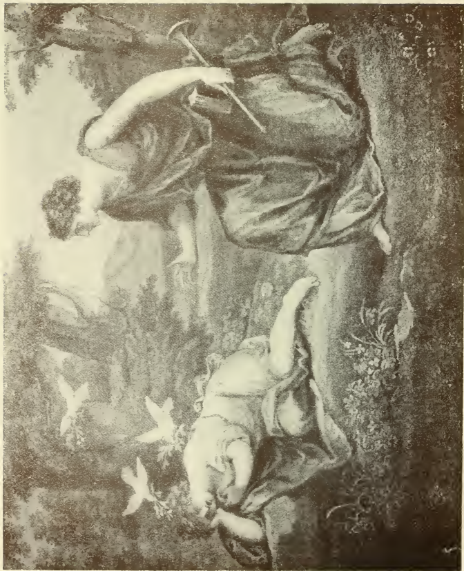
Ang. Kauffman pinx.